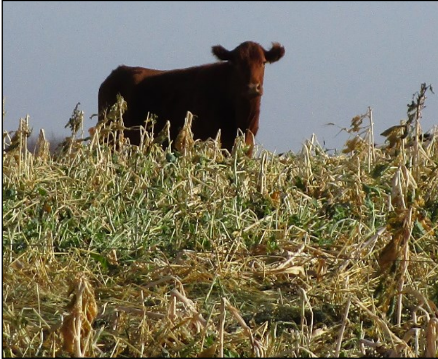
A cow grazing in a field with cover crops in Renville County.