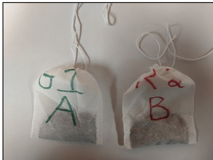
Tea bags are labeled before being buried.