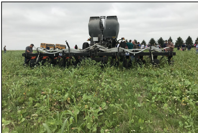
A Renville County farmer interseeding with a no-till drill.

taining a living root in the ground increases soil structure, as well as increases soil organic matter and microorganism activity. The diversity of cover crops also provides livestock producers the ability to graze in late fall and early spring. Interseeding cover crops in between row crops have also shown to suppress weeds, as well as combat disease without affecting yield. A common way to incorporate cover crops is by using a no till drill. This allows for producers practicing no till and cover crops to effectively plant crops.