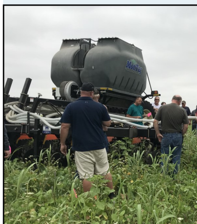
Field day attendees look at cover crop seeding equipment while standing in a field of cover crops.

The Renville County Soil and Water Conservation District and the Hawk Creek Watershed Project are planning their annual soil health field day for the fall of 2021. Look for more details to come soon. If you have ideas of topics, presenters, or field test plots/practices you would like to see, please let us know.