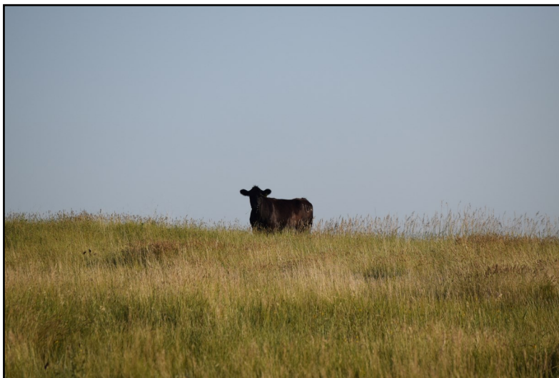
A cow grazing CRP land in Renville County.

Management of CRP land is an important part of the program. Many livestock producers utilize the ability to hay or graze the land at the halfway point of the contract. This is important because the land can still be beneficial to a producer's whole farm operation. This is a way for farmers to still utilize the land. The other benefit is the restoration of soils. This