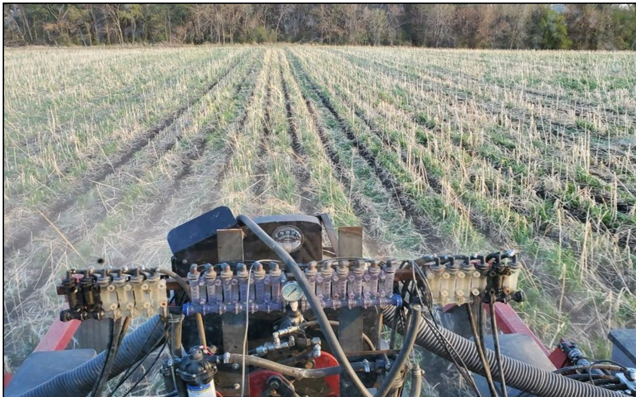
No-till planting corn into bio-strips.

When asked why farmers should consider bio-strips, Schroeder said, “to spread out their workload.”