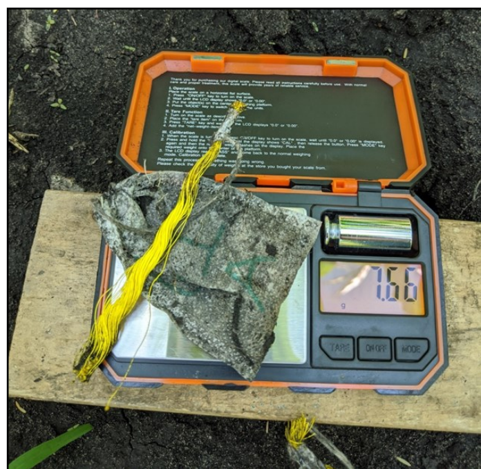
A tea bag is weighed after being dug up.